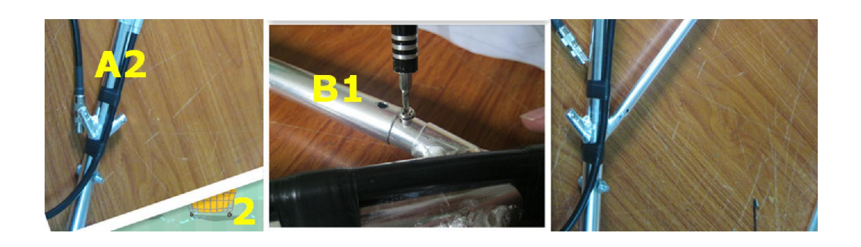
Step2: Connect another end of B1 to A2