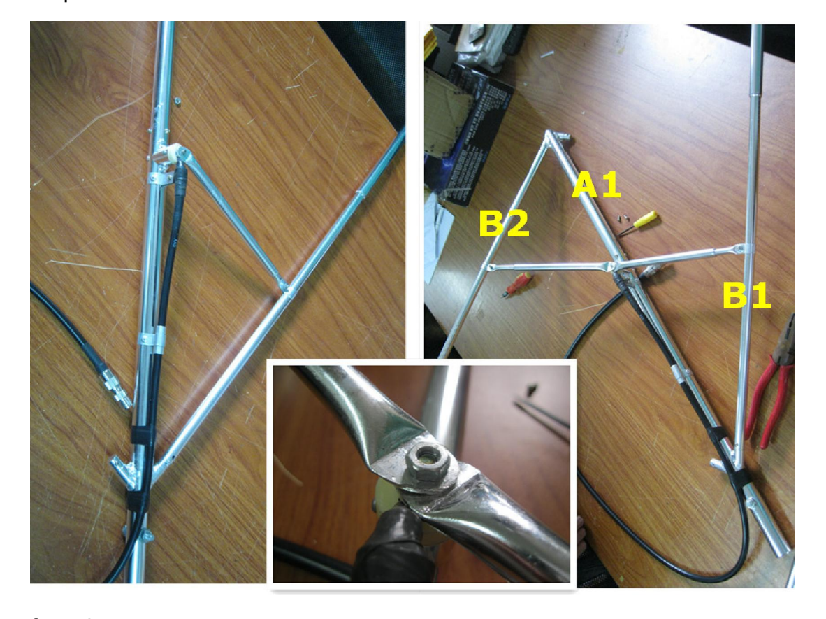
Step 3: Connect one end of B2 to D1, Connect another end of B2 to A1